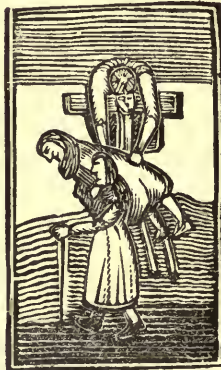
Taken down from the Cross.

hall and kept his estate at the table; in the middle sat the Dean, and those of the king's chapel, who immediately after the king's first course "sang a caroll."— Leland . Collect. vol. iv. p. 237.)—Granger innocently observes that "they that fill the highest and the lowest classes of human life, seem in many respects to be more nearly allied than even themselves imagine. A skilful anatomist would find little or no difference in dissecting the body of a king and that of the meanest of his subjects; and a judicious philosopher would discover a surprising conformity in discussing the nature and qualities of their minds."— Biog. Hist. of Engl. , ed. 1804, vol. iv. p. 356.